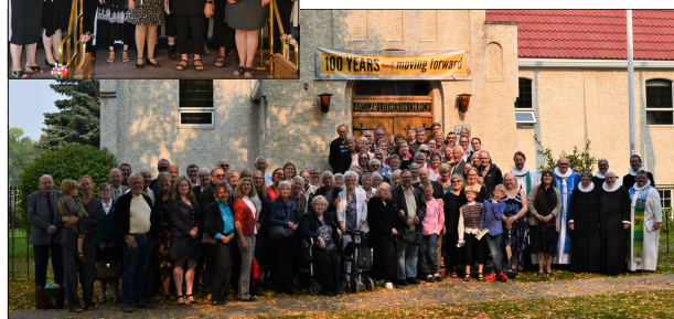
The Congregation after the Festive Sunday Service