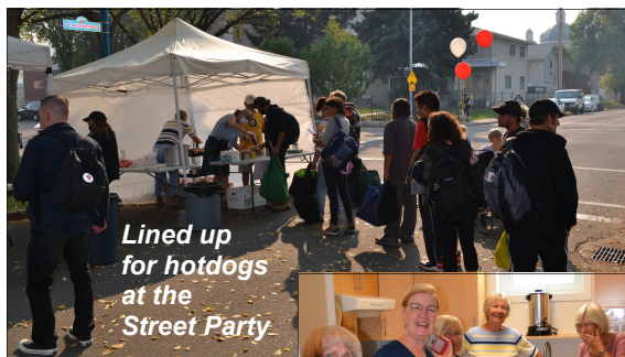
Lined up for hotdogs at the Street Party