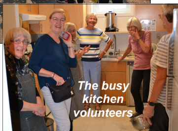
The busy kitchen volunteers